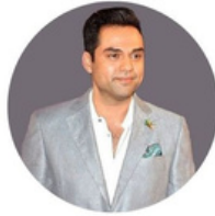
Abhay Deol Actor, Producer, Philanthropist