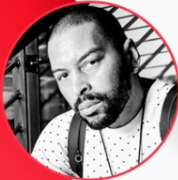
Speaker ARABIAN PRINCE

(Saturday 26th Feb 2020, 5:30 PM - 8:30 PM)