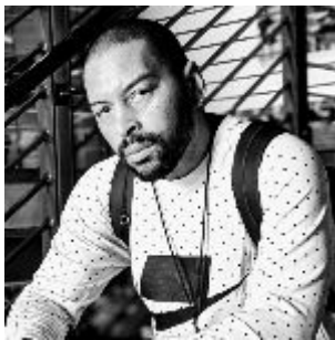
OG Arabian Prince